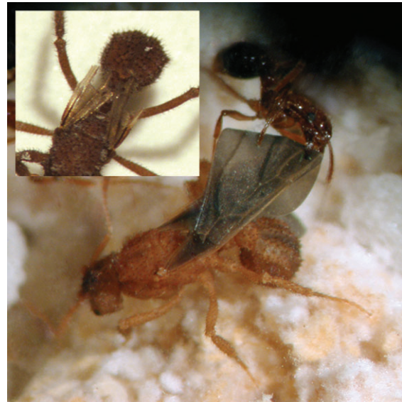
Fig. 3. Parasite worker wing-clipping and thus castrating a reproductive female in a mature host colony. A parasite worker mutilates the wings of a host female, resulting in stubby, non-functional wings (insert).

Two parasitised T. zeteki colonies, not included in the experiment and collected in 1999, were kept in the lab